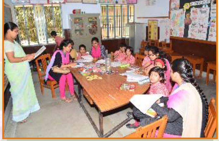
Visit to Special Schools (15th March, 2016)