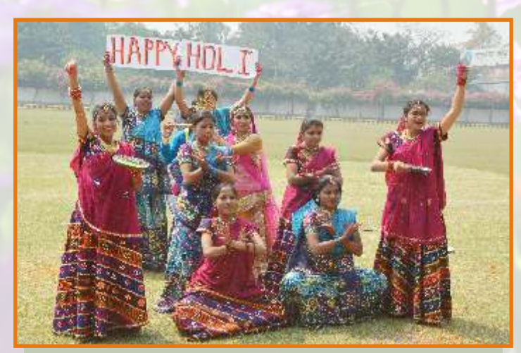
Holi Dance Competition (19<sup>th</sup> March, 2016)