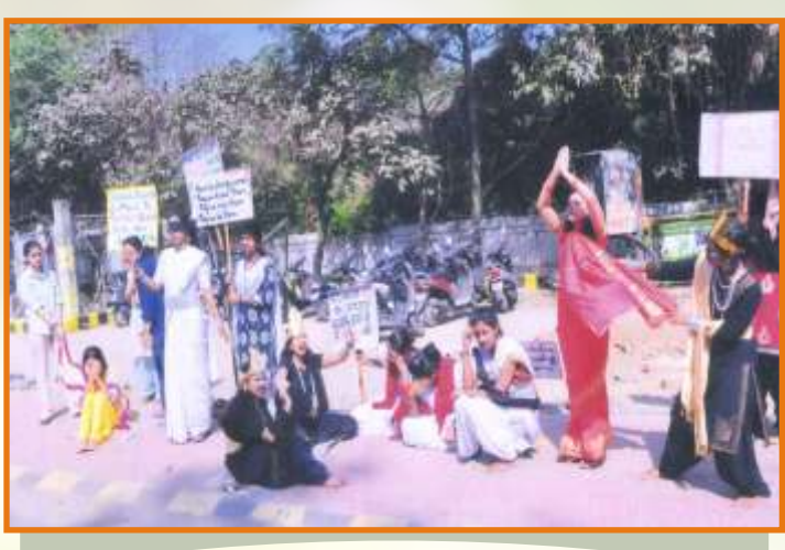
Tableau on International Women's Day (8<sup>th</sup> March, 2016)