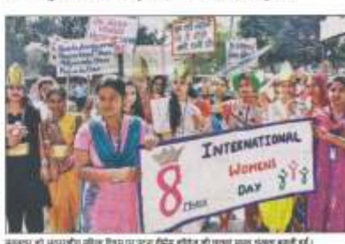
मध्यक्र हो अध्यक्षीय मीरक रिक्रम प्राप्त रहिनेय होतीन की प्राप्त मध्य पंत्रका कार्ती हुई