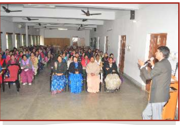
Guest Lecture on Formative Assessment of Student in the Context of CCE (18<sup>th</sup> January, 2016)