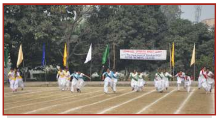
Annual Sports Day (30<sup>th</sup> January, 2016)