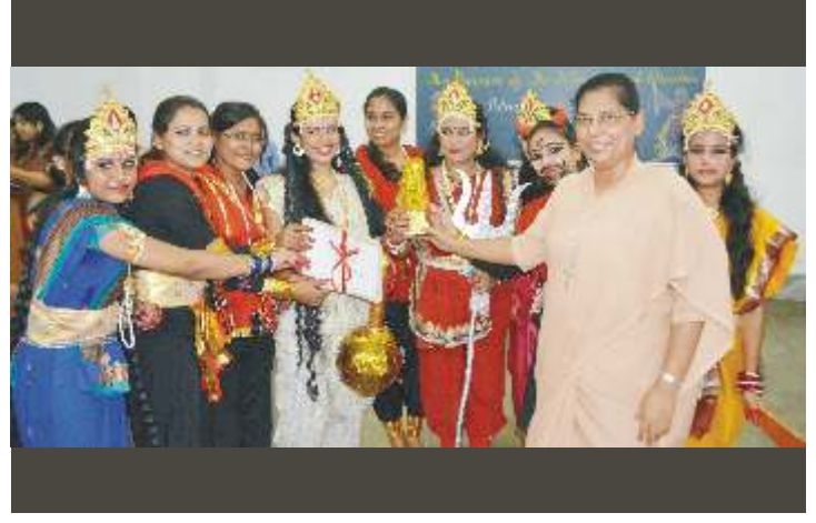
Nrityotsav- Dance Competition (16<sup>th</sup> October, 2015)