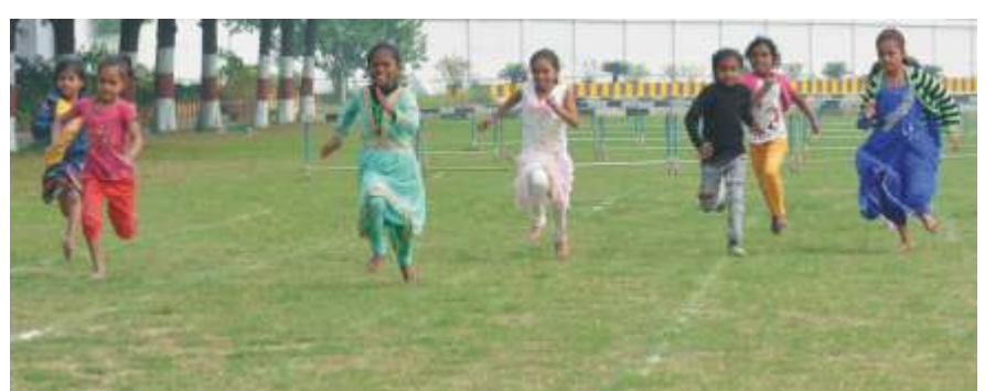
ICWA Sports Meet (6<sup>th</sup> December, 2015)