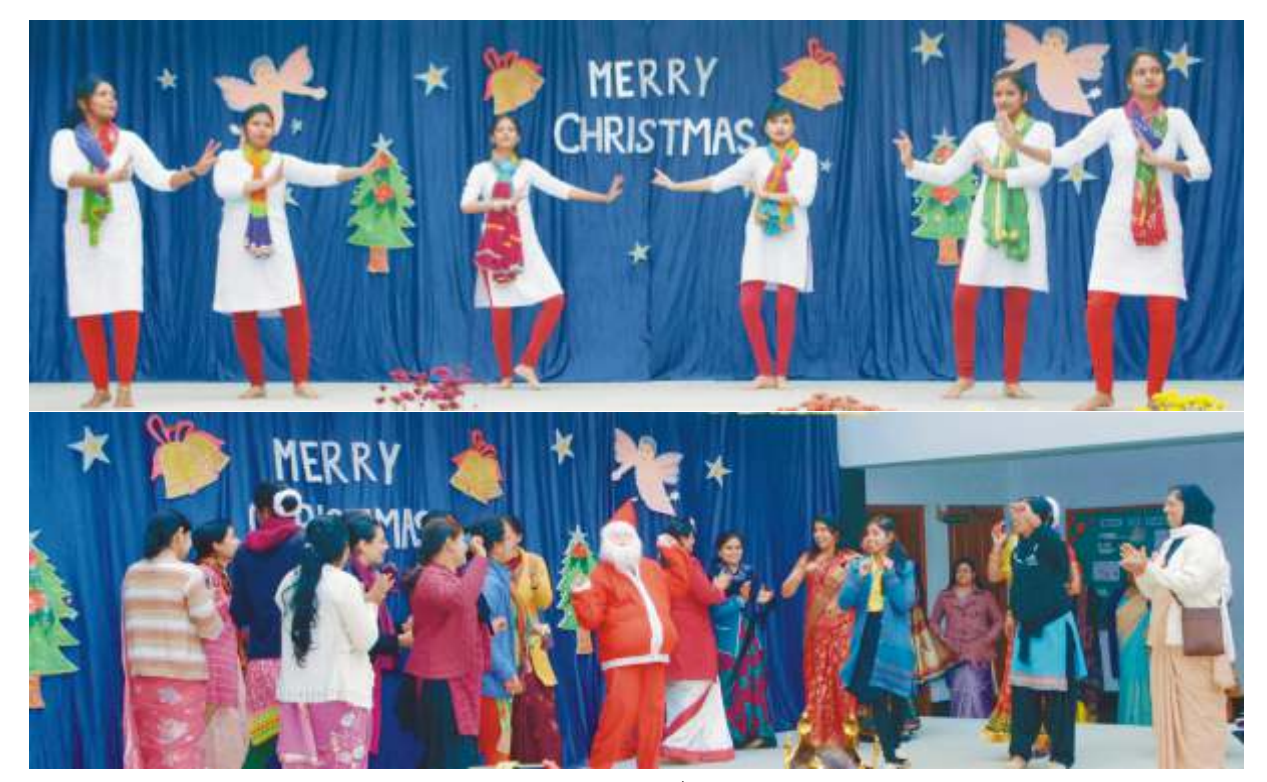
Christmas Celebration (22<sup>nd</sup> December, 2015)