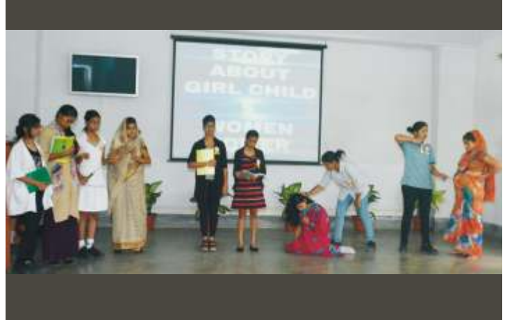
International School, Patna