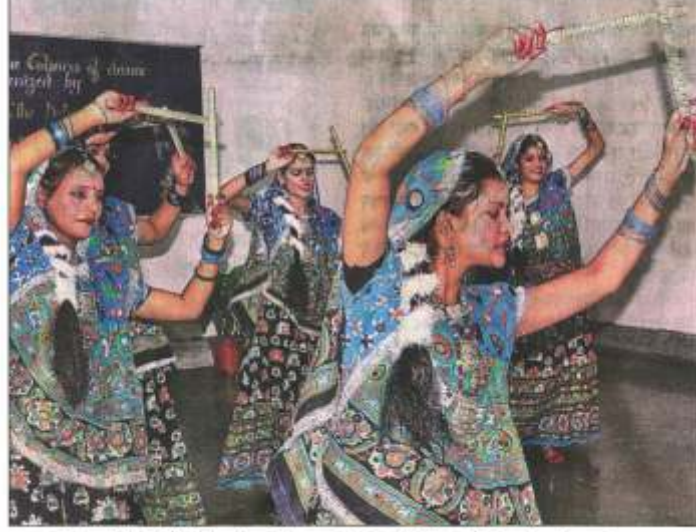
शुक्रवार को पटना वीमेंस कॉलेज में 'नृत्योत्सव-दी कलर ऑफ डांस' के दौरान डांडिया नृत्य करती छात्राएं।

में ब्ल. ग्रीन और येलो हाउस के आठ ग्रप ने परफॉर्म किया। इस दौरान छात्राओं ने एक ग्रुप ने अपने नृत्य के जरिए मां दुर्गा के नौ रूपों को प्रदर्शित किया। इस दौरान माहील पूरा भवितमय बन गया। परफॉर्मेंस के अंत में सबने खंडे होकर तालियां बजाई। अंत में कोड संख्या ८ की छात्राओं को प्रतियोगिता का विजेता चुना गया। विजेता छात्राओं को प्रावार्या ने टॉकी और सर्टिफिकेट देकर सम्मानित किया।